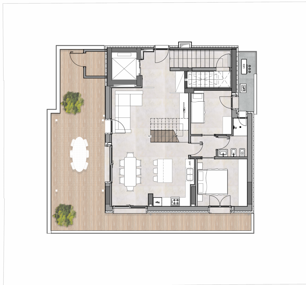
Pianta piano quarto Scala 1:100